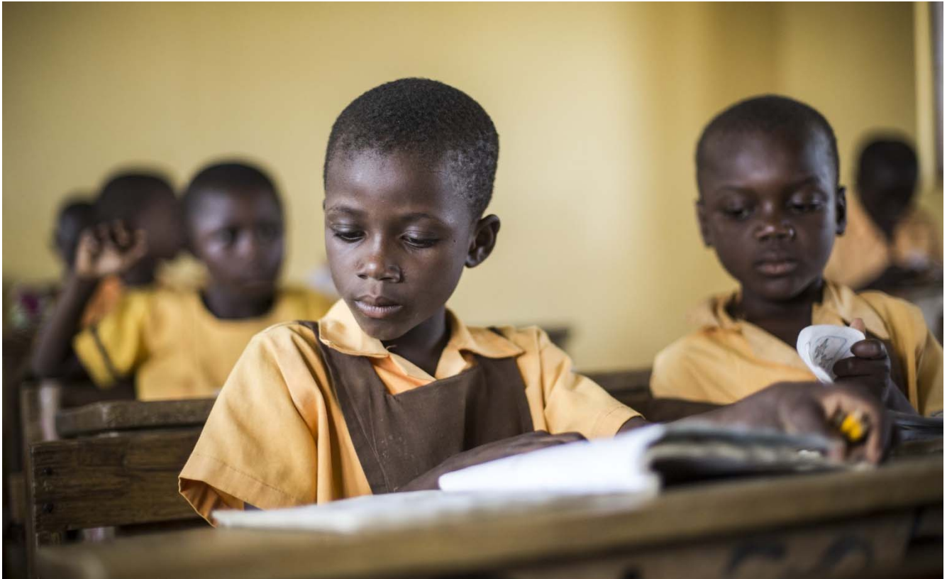
Children attending school in Northern Ghana, December 2015. Northern Ghana has poverty levels two to three times higher than the national average. The region is covered by dry savannah land and lacks key infrastructure.